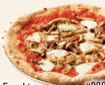
Funghi ¥990 Tomato sauce / Mozzarella / Parmesan Shimeji, King oyster and Maitake mushrooms