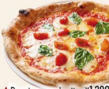
★ Premium Margherita ¥1,290 Tomato sauce / Scamorza Tomato / Parmesan / Basil

The price is the sum of half the price of each pizza +¥190