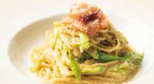
Japanese style peperoncino with asparagus and smoked salmon