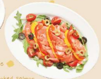
Smoked salmon carpaccio