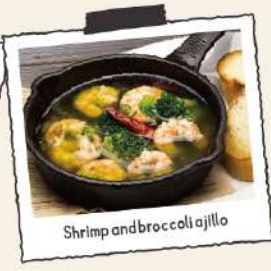
Shrimp and broccoli ajillo