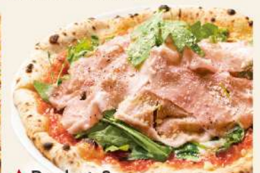
★ Rocket & Uncured ham ¥1,490 Tomato sauce / Mozzarella / Parmesan / Uncured ham / Arugula