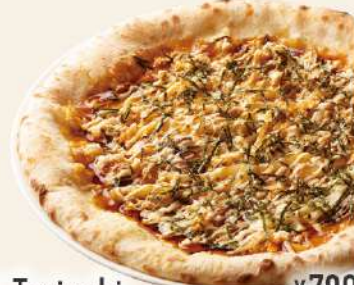
Teriyaki ¥790 Teriyaki sauce / Parmesan Steamed chicken / Onion