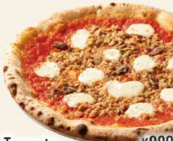
Tonnata ¥990 Tomato sauce / Oregano / Tuna Mozzarella / Anchovies / Parmesan