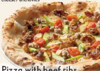
Pizza with beef ribs and salsiccia ¥1,590 oyster soy sauce / butter / beef ribs / salsiccia / onions / asparagus / mini tomatoes / mozzarella cheese / parmesan cheese / fried garlic