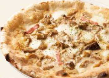
★ Porcini ¥1,590 Porcini sauce / Porcini / Shimeji, King oyster and Maitake mushrooms / Mozzarella / Parmesan