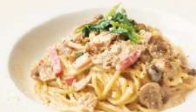
Porcini cream sauce pasta with 3 kinds of mushrooms