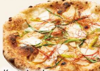
Kyoto bamboo shoot pizza ¥1,490 Oyster soy sauce / Bambooshoot / Mozzarella / Kujo green onion / Parmesan