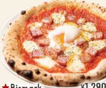
★ Bismark ¥1,290 Tomato sauce / Bacon / Soft-boiled Egg / Mozzarella / Parmesan