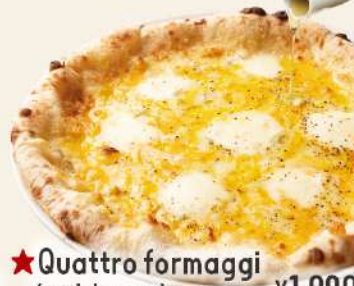
★ Quattro formaggi (with honey) ¥1,090 Gorgonzola / Red cheddar Mozzarella / Parmesan