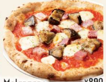
Melanzane ¥890 Tomato sauce / Bacon / Onion Eggplant / Mozzarella / Parmesan