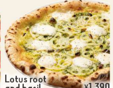
Lotus root and basil ¥1,390 Basil sauce / Pine nuts / Lotus root / Mozzarella / Parmesan