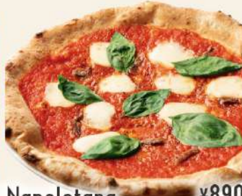
Napoletana ¥890 Tomato sauce / Oregano / Basil Mozzarella / Anchovy / Parmesan