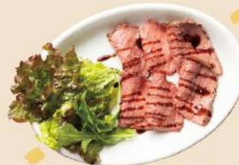
Roast beef with Balsamic sauce