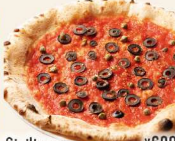
Siciliana ¥690 Tomato sauce / Oregano Black olives / Caper / Anchovy