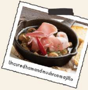
Uncured ham and mushroom ajillo

★ Shrimp and spring vegetables in Japanese dashi ajijio ..... ¥980