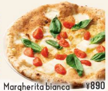
Margherita bianca ¥890 Mozzarella / Parmesan / Tomato Basil