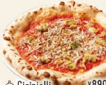
Cicinielli ¥890 Tomato sauce / Oregano Clams / Whitebait / Garlic oil