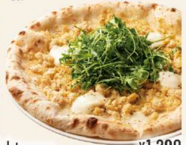
Limone ¥1,290 Steamed chicken / Rocket Lemon sauce / Mozzarella / Parmesan