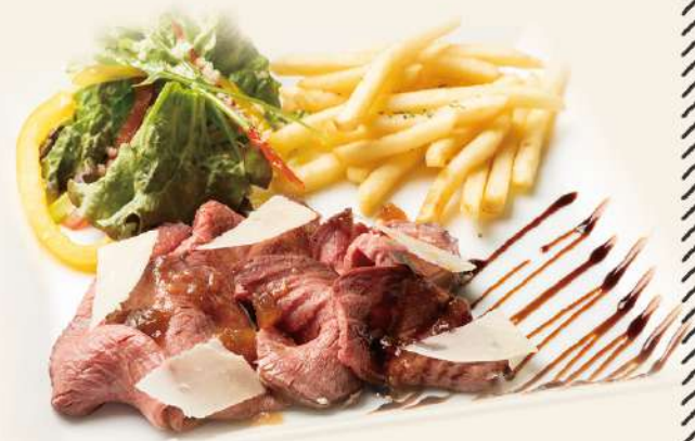
Beef tagliata with grated parmigiano-reggiano