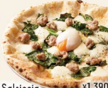
Salsiccia ¥1,390 Spinach / Salsiccia / Mozzarella / Parmesan / Soft-boiled egg