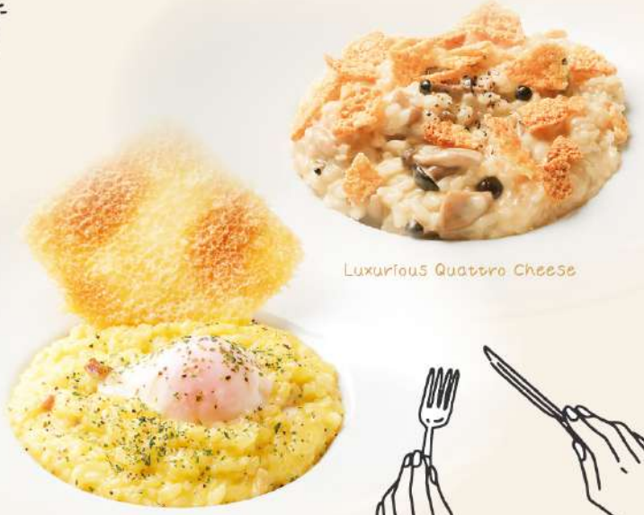
Luxurious Quattro Cheese

Uncured ham green risotto with basil sauce ..... ¥1,390