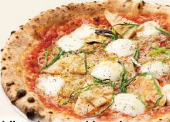
Whitebait and bamboo shoot marinara ¥1,490 Tomato sauce / Bambooshoot / Whitebait / Anchovies / Oregano / Mozzarella / Parmesan / Kujo green onion