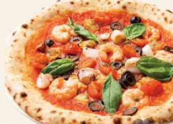
Pescatora ¥1,590 Tomato sauce / Oregano / Tomato / Clams / Shrimp / Squid / Capers / Black olives / Anchovies