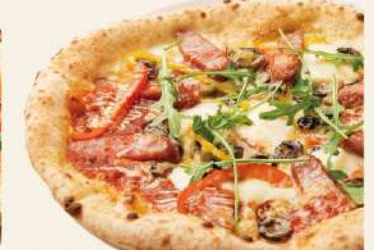
🌶️ Spicy Mexican ¥1,590 Salsa sauce / Sausage / Paprika / Jalapeno pepper / Black olives / Mayonnaise / Mozzarella / Parmesan