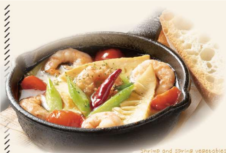
Shrimp and spring vegetables in Japanese dashi ajijio