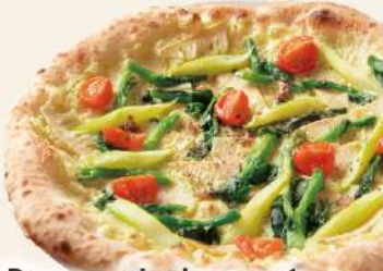
Pizza with plenty of spring vegetables ¥1,490 asparagus / rape blossoms / bamboo shoots / small tomatoes / mozzarella cheese / parmesan cheese / anchovies