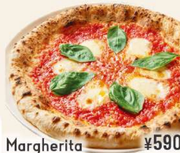
Margherita ¥590 Tomato sauce / Basil Mozzarella / Parmesan