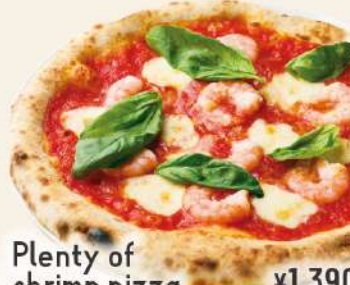
Plenty of shrimp pizza ¥1,390 Tomato sauce / Basil / Mozzarella / Parmesan / 8 shrimp