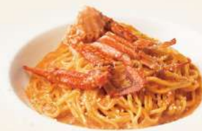
Crab and tomato cream sauce

★ Japanese style peperoncino with asparagus and smoked salmon ..... ¥1,490