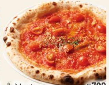
Marinara ¥790 Tomato sauce / Oregano / Tomato Garlic oil / Garlic