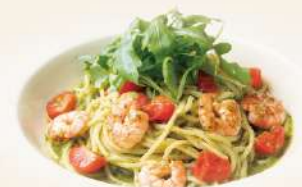
Genovese pasta of basil and shrimp