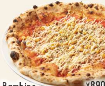
Bambino ¥890 Tomato sauce / Tuna / Sweet Corn Parmesan / Mayonnaise