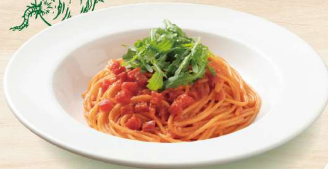
Beet Rose Pasta ¥1,390

Tomato sauce/Oregano/Cherry tomatoes/Garlic oil/Garlic slices