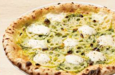
Lotus root & Basil ¥1,390

Basil sauce/Pine nuts Lotus root/Mozzarella/Parmesan