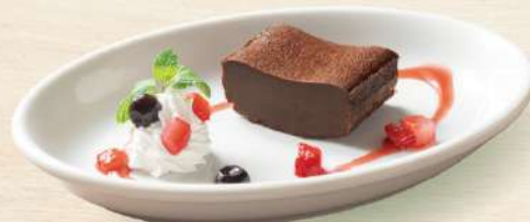
Vegan Chocolate Cake ¥590

Sunny lettuce/Mizuna/Bell pepper/Cherry tomato/Mushroom