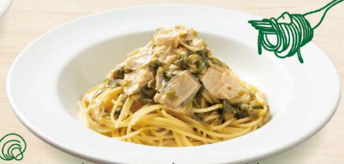
Japanese style pasta with tofu skin and sea lettuce ¥1,290

Tofu skin/sea lettuce/Yuzu Kosho/Kelp tea