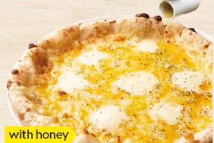
Quattro formaggi ¥1,090

Basil sauce/Pine nuts Lotus root/Mozzarella/Parmesan