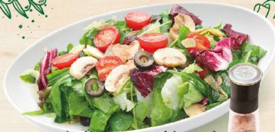
Italian vegetable and Kyo Mizuna Salad

Tofu skin/sea lettuce/Yuzu Kosho/Kelp tea